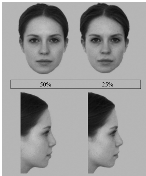
Figure 2. An example of the stimuli used in Experiment 2. -25% and -50% denote 25% and 50% morph toward the average (anticaricature). Note that more blur was applied to the images in Experiment 2 in order to better equate the quality of the images.